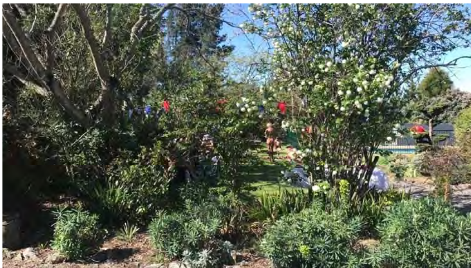
The Tulip Cream Tea was held at Wai-Natur Naturist park in the Wairau Valley.