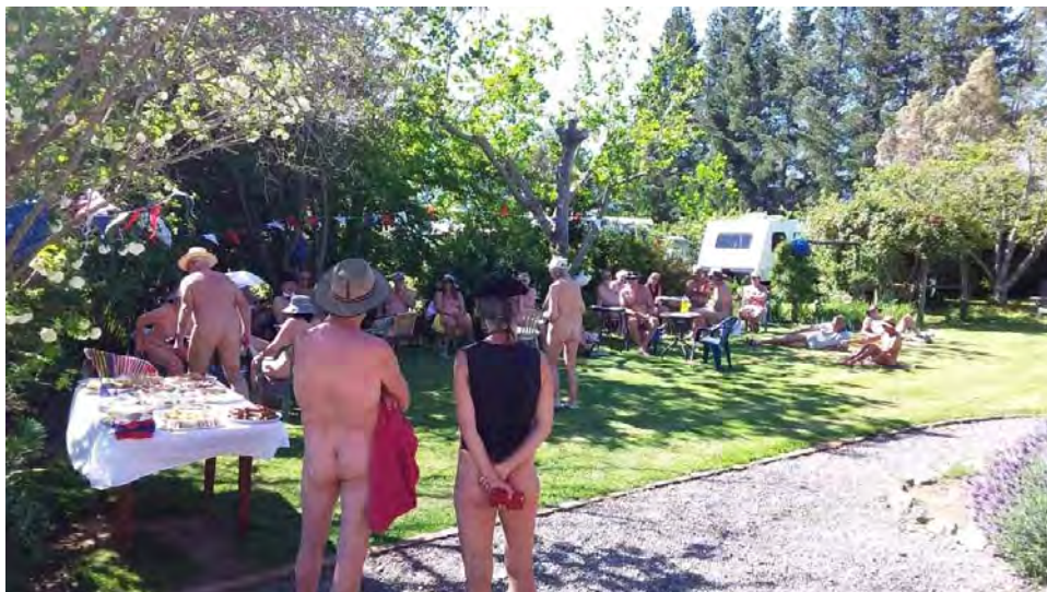
Members of the naturist community showed their support for Parkinson's disease awareness over the weekend.

"I'm not particularly brave, but I think it's been a good thing because it draws people together and it gave a lot of people the opportunity to give back."