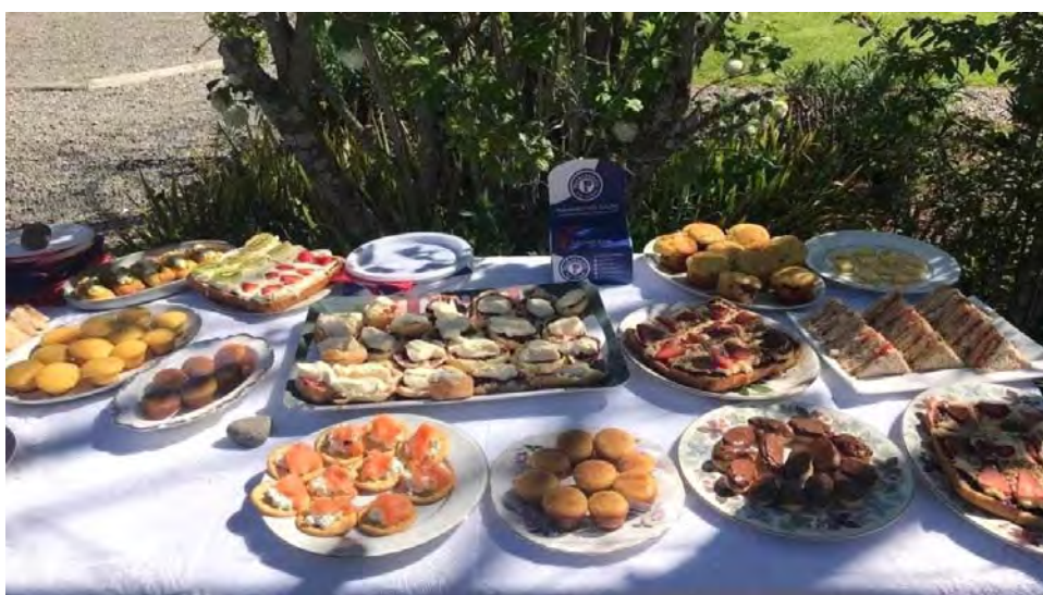
Tulip Cream Teas were held all over the country through Parkinson's New Zealand.

https://www.stuff.co.nz/national/health/123225408/naturist-community-gets-behind-parkinsons-disease-support-in-marlborough?fbclid=IwAR25tgk9nNfxqiPRM7qVx_Di19K38Jv0h8AFUbyrf0P38ByAGkXMBDIZ694