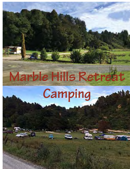
Marble Hills Retreat Camping